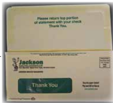
For many years you received your Jackson Electric bill in this envelope.

We recently were notified that the company who prints our billing envelopes will soon be "phasing out" our currently used 'send and return' yellow envelopes.