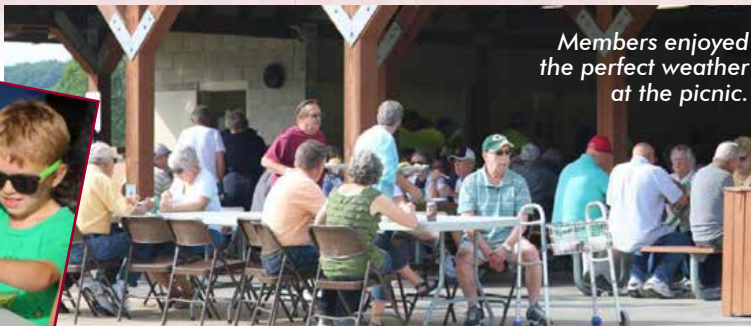
Members enjoyed the perfect weather at the picnic.