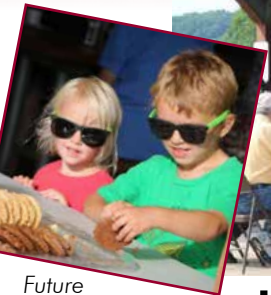
Future cooperative leaders.