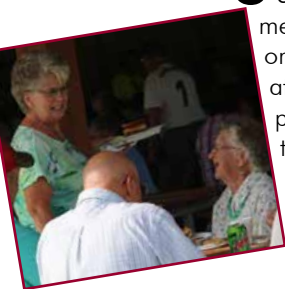
Fellowship is contagious at the annual picnic.

Jackson Electric employees and directors served 600 people at its annual member picnic in the park on August 15. Those in attendance enjoyed pulled pork sandwiches with the traditional picnic sides.