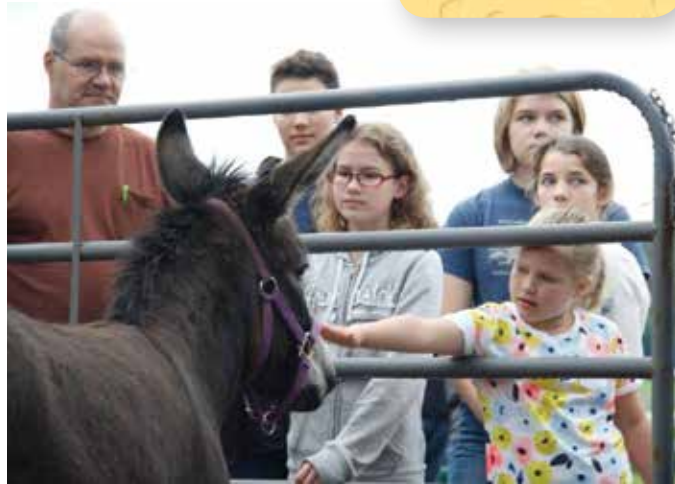
At the breakfast, kids of all ages enjoy petting animals they typically don’t get a chance to touch.

Parking is available on-site. In case of inclement weather, please tune your radio to WWIS-FM (99.7) or Jackson County Dairy Promotion’s Facebook page for updates.