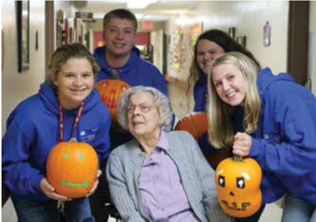
Youth ambassadors decorated and delivered pumpkins to area nursing homes last October.