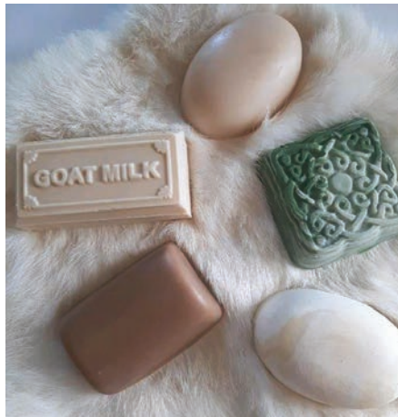
Black River Falls FFA member Wyatt Berg produces goat milk soap, expressing creativity with fun molds.

The hot process continues to heat the solution so that it thickens and bubbles. Some sources describe the texture as being like Vaseline, glossy, or wax-like. "I like using the hot process because of the turnover rate," says Kelly. "Once the product is poured into the molds, it cures and is ready to use almost right away."